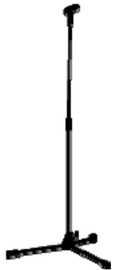
Dee Dee Bonomo Vox