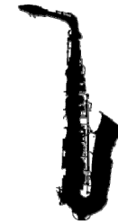
Kyle Brooks Saxophone